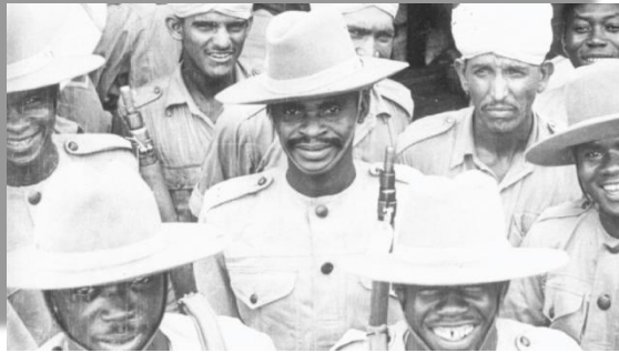
MOD "We were there" exhibition